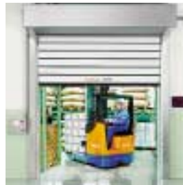
■ SST-ISO-K high-speed spiral door k-value = 0.5 W/m 2 K