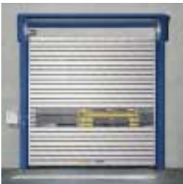
■ SST high-speed spiral door

■ More information: www.efaflex.com or simply send the fax response form: +49-(0)8765/82-100