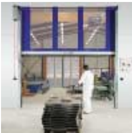
■ SRT-EL high-speed roll-up door