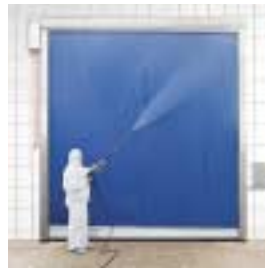
■ SRT-EC high-speed roll-up door food and hygienic area