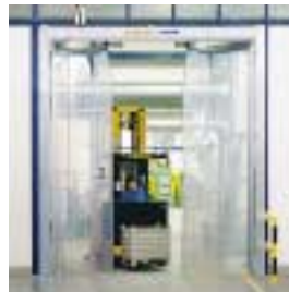
■ ES elastic high-speed folding door