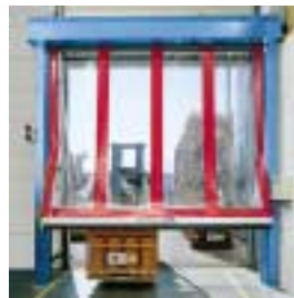
■ SRT high-speed roll-up door