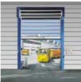
■ STT high-speed turbo door