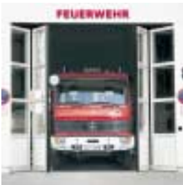
■ AS aluminium-high-speed folding door